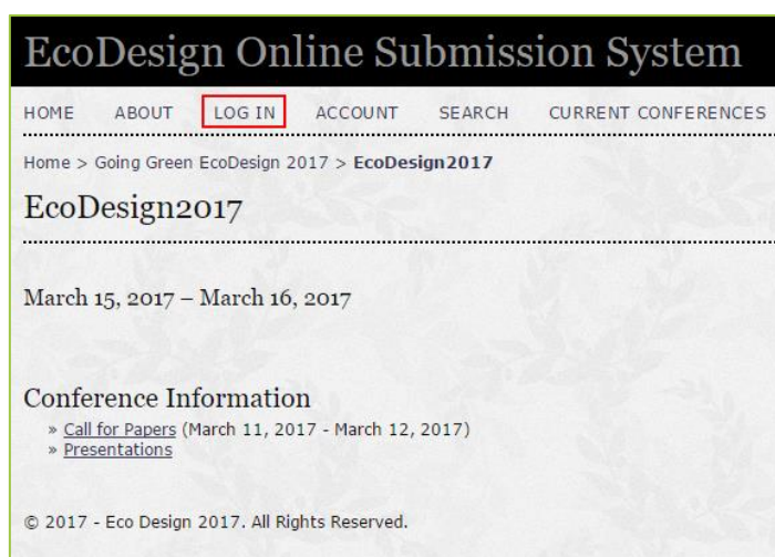
Figure 1 Log In