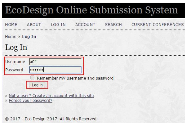
Figure 2 Log In form